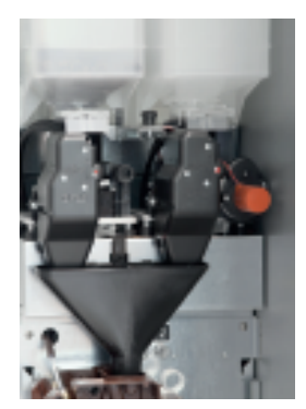
Automatic regulation for Top coffee grinding