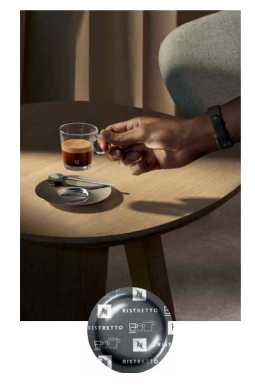
RISTRETTO Intensity 9