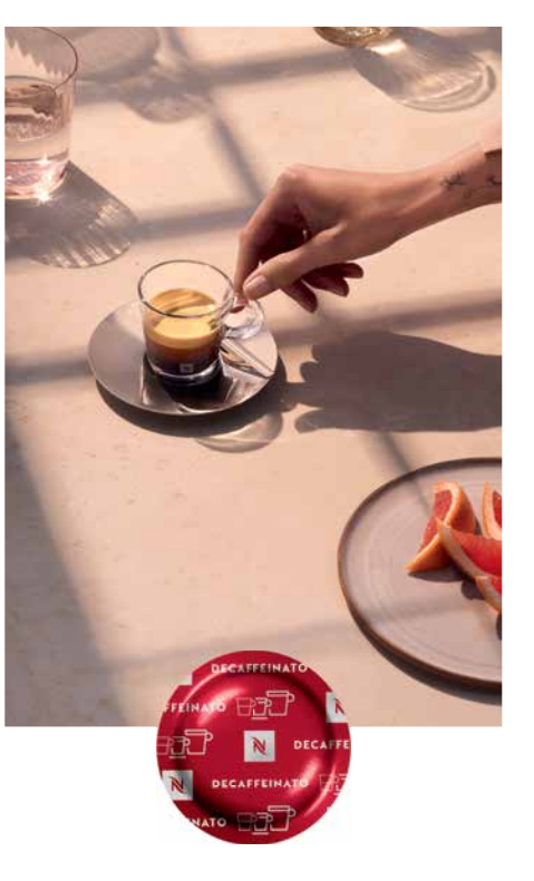
DECAFFEINATO Intensity 7