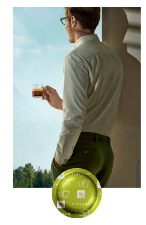
FINEZZO Intensity 5