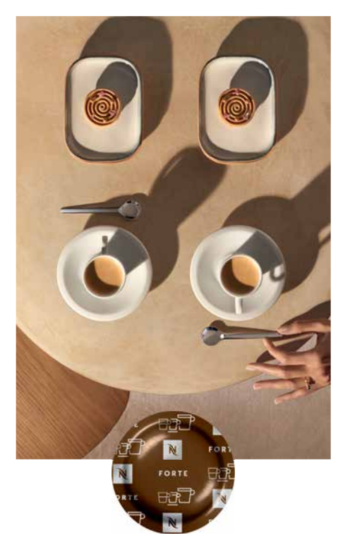
FORTE Intensity 7