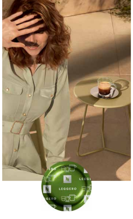
LEGGERO Intensity 6