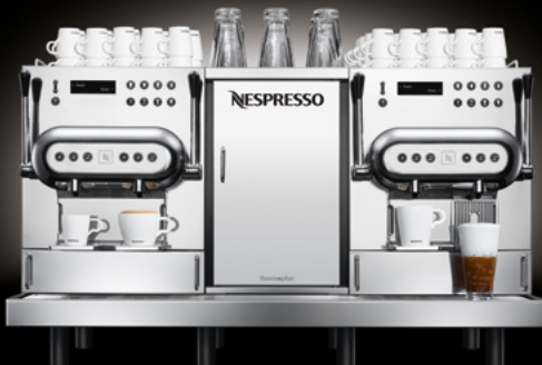
AGUILA | AG 420 PRO