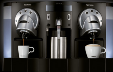
GEMINI 220 MILK SOLUTION