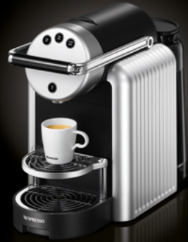
ZENIUS | ZN 100 PRO