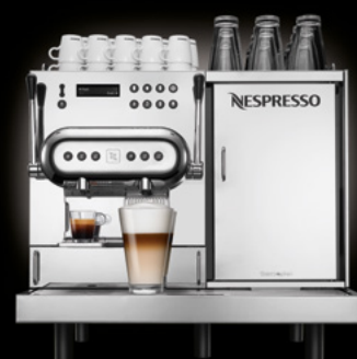
AGUILA | AG 220